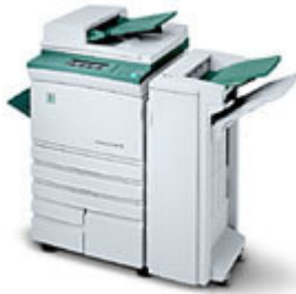
Document Centre 555

Optional OCR module produces full text searchable PDF or RTF files