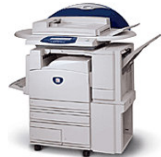
WorkCentre Pro 65

What's on your scanned document wishlist? With CIM, users can verify image integrity with easy access to number of pages and file size; users can also easily reorder, rotate, or delete pages. Use the CIM touchscreen to annotate your file with post-it and text notes!